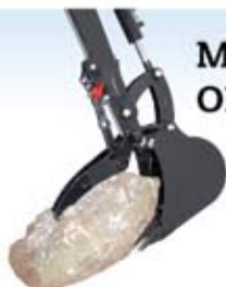
MECHANICAL THUMB OR EXTRA BUCKET