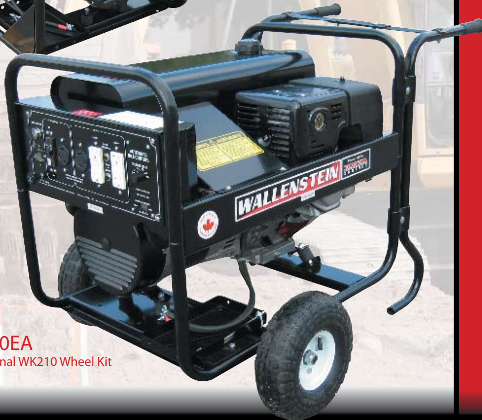
GF6000EA with optional WK210 Wheel Kit