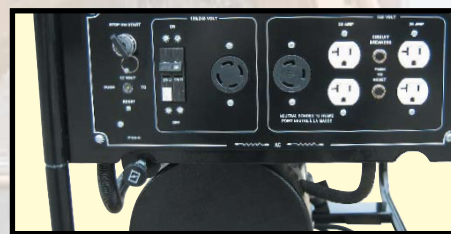
EU SERIES CONTROL PANEL AND ELECTRICAL OUTLETS