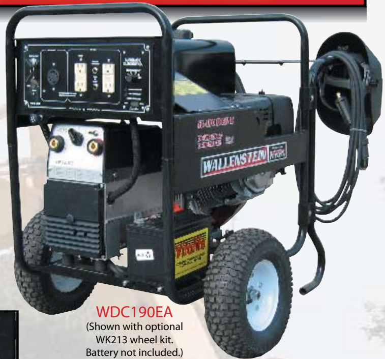
WDC190EA (Shown with optional WK213 wheel kit. Battery not included.)