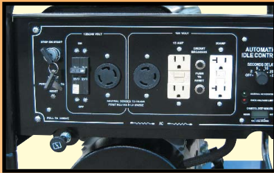
GF SERIES CONTROL PANEL AND ELECTRICAL OUTLETS