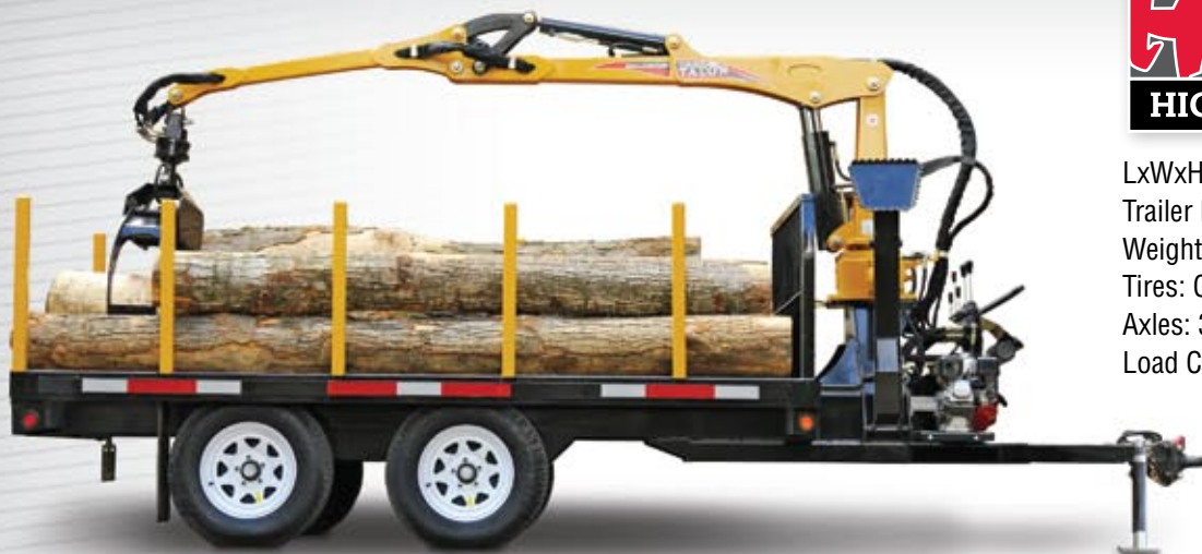
LX100 Shown with HT40

LxWxH: 19' 2" x 72" x 90" Trailer Bed Length: 10' 6" Weight: 2150 Lbs. Tires: Carlisle ST205/75R14 Axles: 3500# Load Capacity: 4760 Lbs.