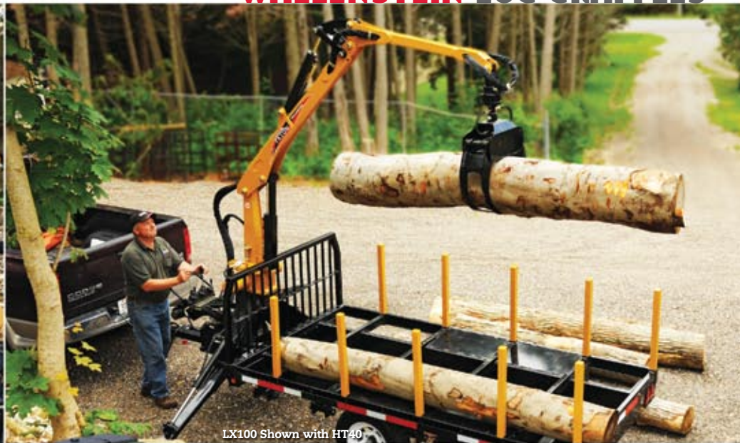
LX100 Shown with HT40