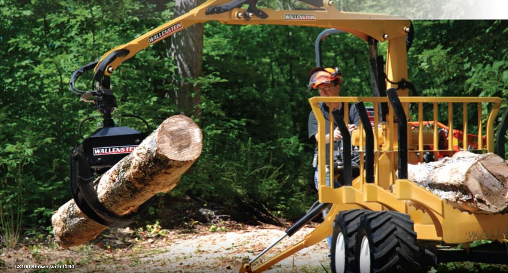
LX100 Shown with LT40