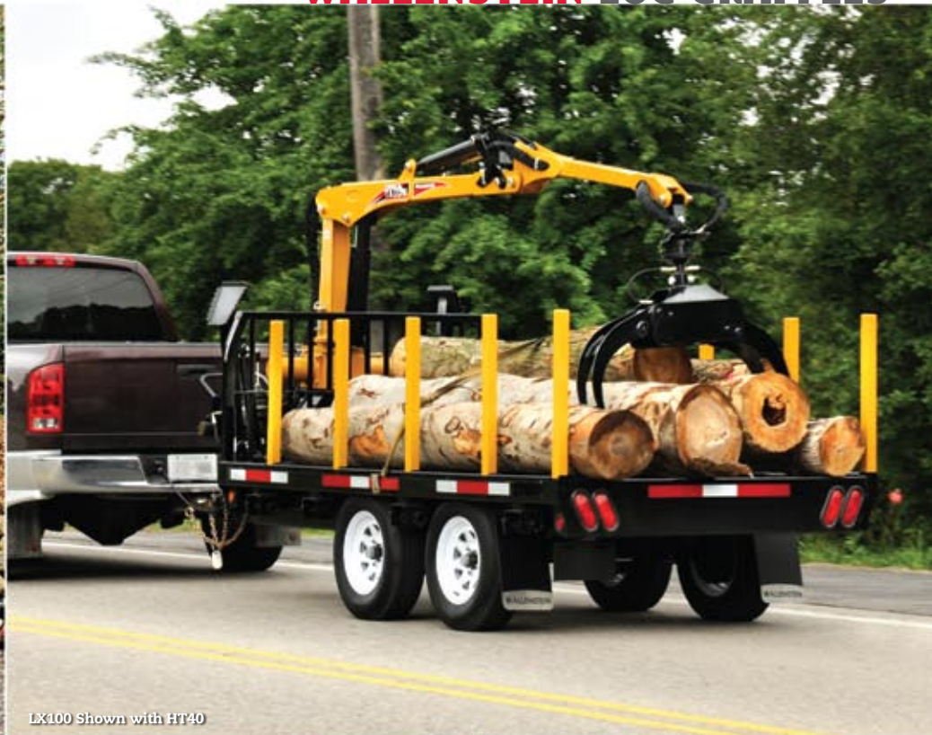
LX100 Shown with HT40