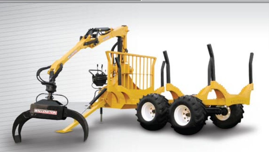
LX100 Shown with LT40

Serrated edges minimize load shifting during transport.