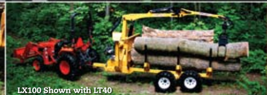
LX100 Shown with LT40

8-ply Traction tires provide grip and durability on rough trails while the Walking Beam axles absorb bumps and ruts for smooth trailing.