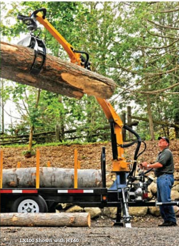
LX100 Shown with HT40