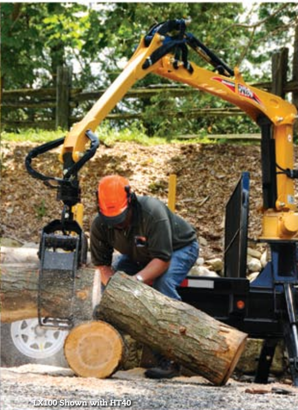
LX100 Shown with HT40